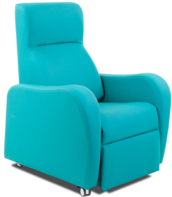
Fabric in image: Valencia Turkis