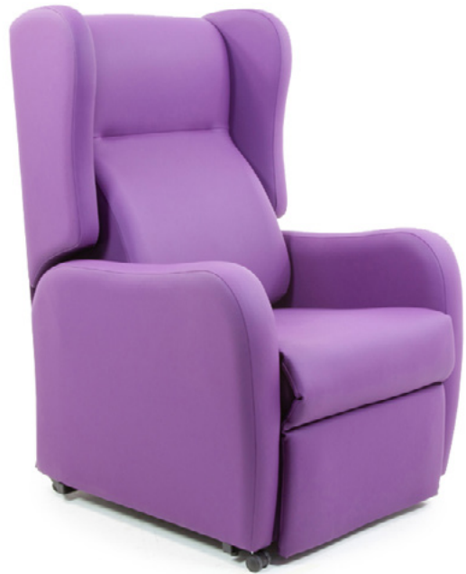
Fabric in image: Valencia Amethyst