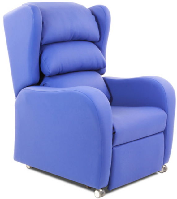
Fabric in image: Valencia Delft

Designed with wider support arms compared to the Delaware chair, which offers a larger contact surface area. This chair has waterfall back cushions for ultimate comfort, three deeply soft cushions support your head, neck, and full length back.