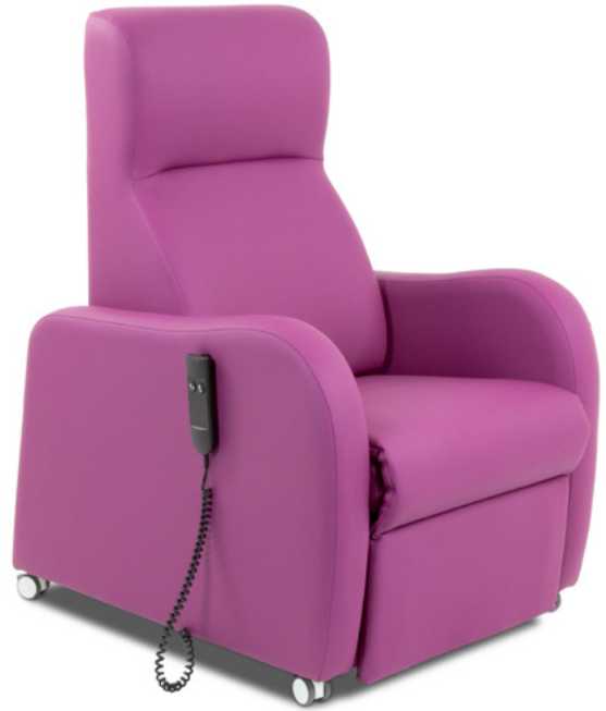
Fabric in image: Valencia Berry