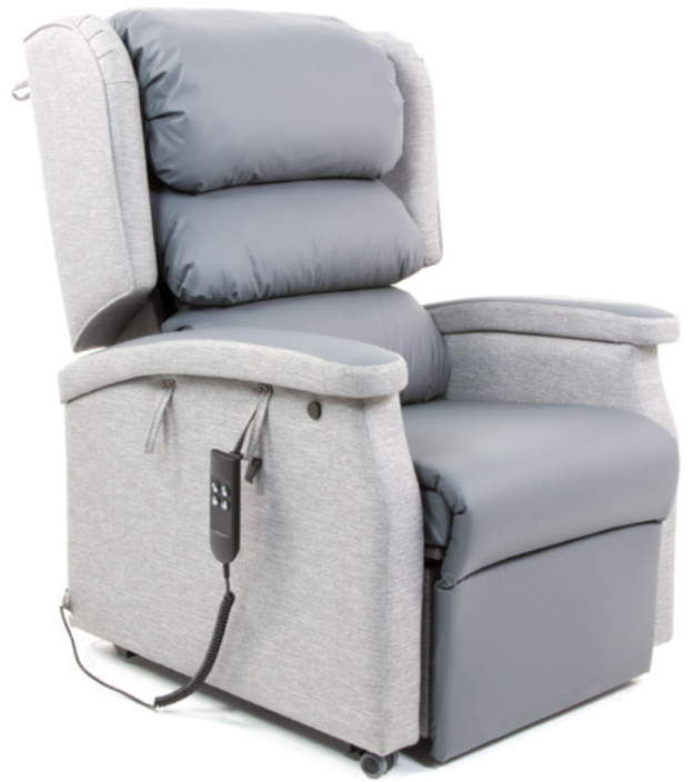
Fabric in image: ILIV Compass Silver outer Dartex Vp Grey in contact areas

The Lynton has been specifically designed to assist Equipment store providers, Local authorities, Care Home and Distributors to maximise budgets to stretch further.